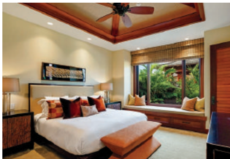
From top: tropical greenery surrounds the entrance to the Four Seasons Hualalai residence; natural accents in one of the villa's five bedrooms

lava stone accent walls, koa wood furnishings, and lush, tropical landscaped grounds, the villa celebrates natural Hawaiian materials while still providing modern amenities such as a Sonos audio system and a full outdoor kitchen equipped with a Kalamazoo barbecue and pizza oven and an EVO grill. hualalairealty.com