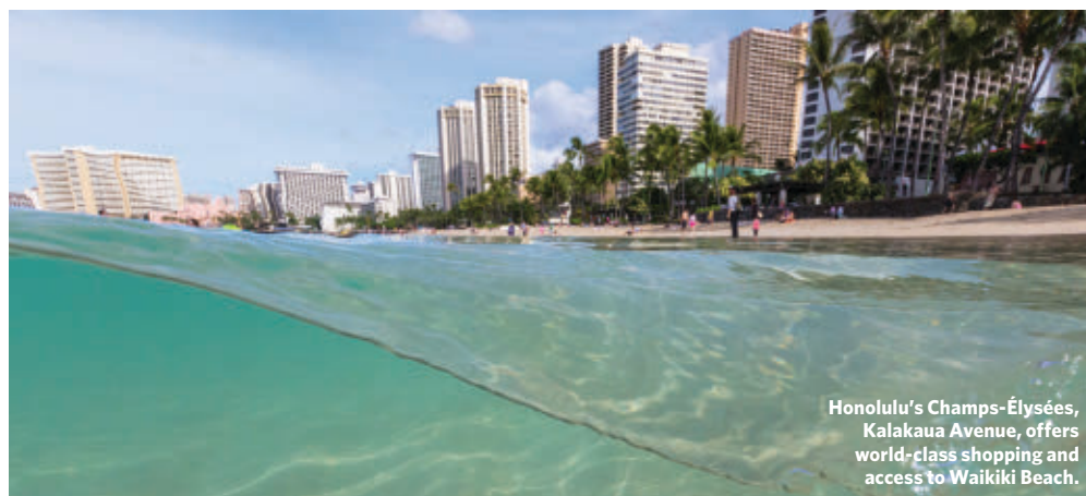
Honolulu's Champs-Élysées, Kalakaua Avenue, offers world-class shopping and access to Waikiki Beach.