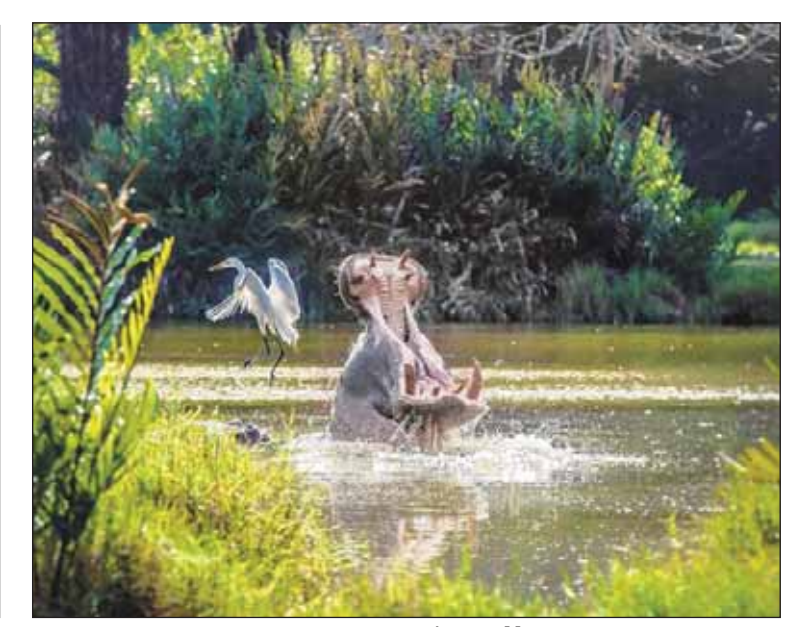
AURORE MARTIGNONI Getty Images / EyeEm