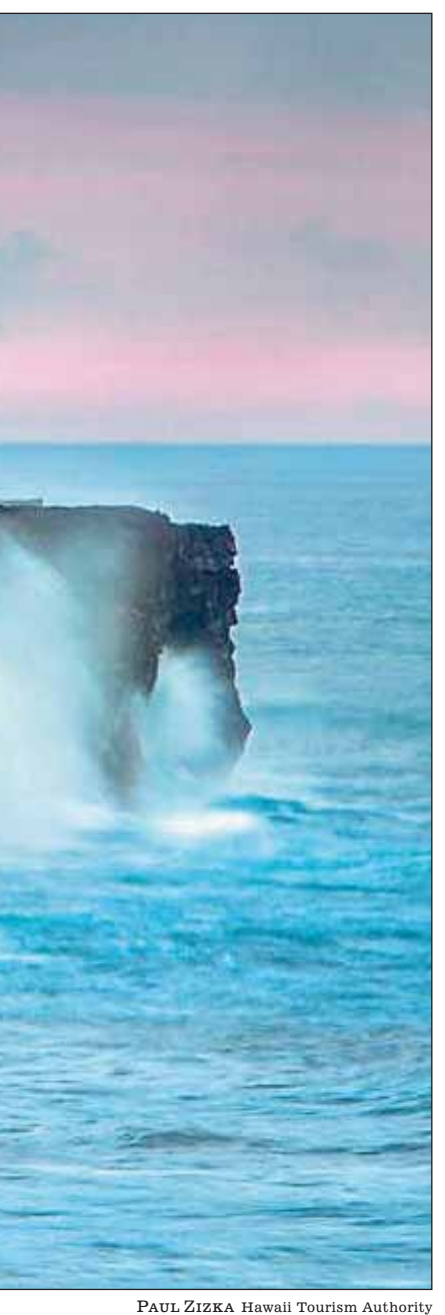
heading to the sunny Kohala Coast.