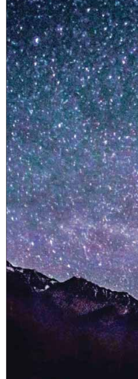
KETCHUM is part of the Central