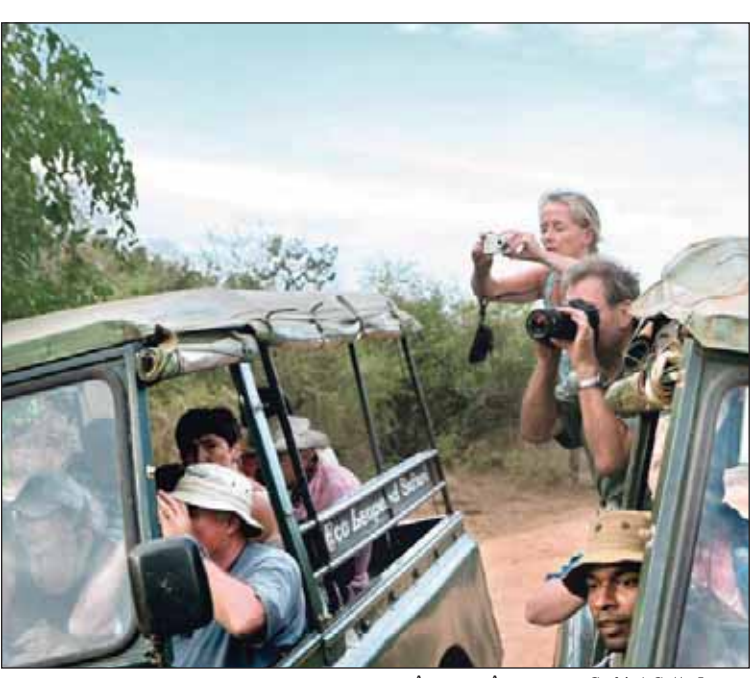
SRI LANKA'S Yala National Park draws wildlife enthusiasts.