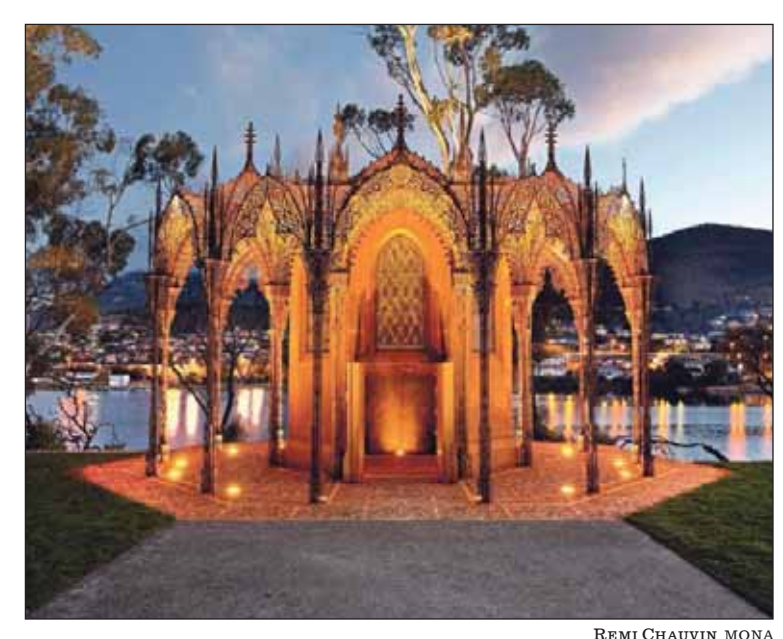
TASMANIA, Australia's Museum of Old and New Art.