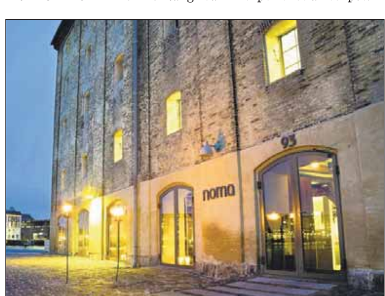
COPENHAGEN gains ever more notice for food, especially Noma.