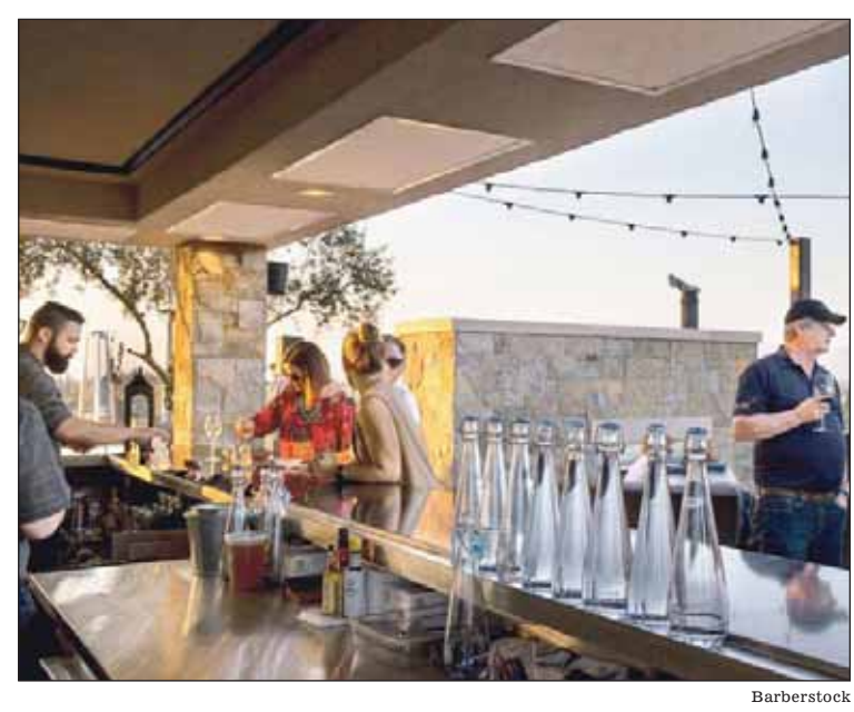
NAPA, Calif., is adding lodging, including the Archer Hotel.