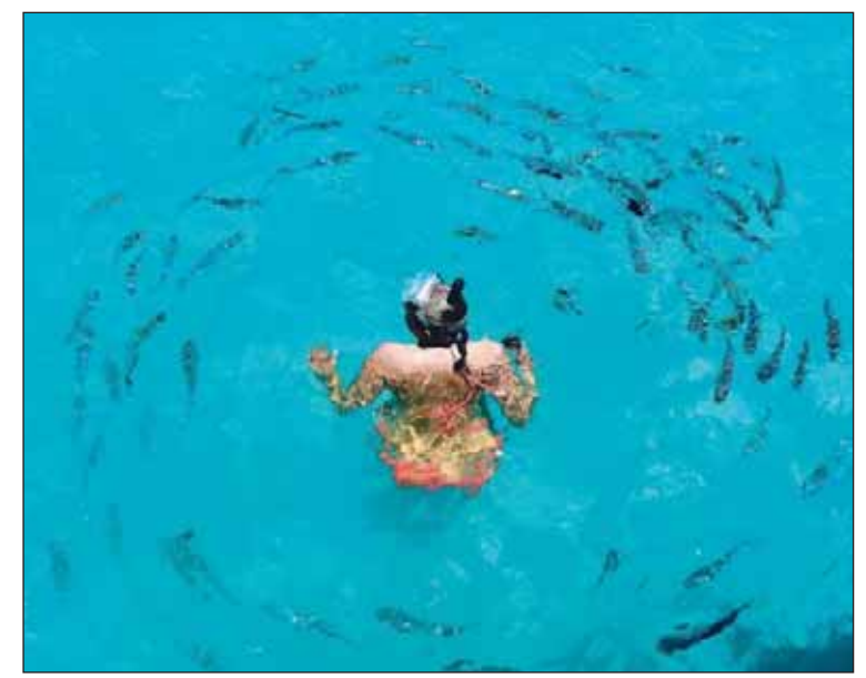
FRENCH POLYNESIA'S Rangiroa will experience an eclipse.