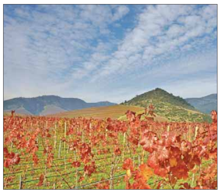
CHILE'S ELQUI VALLEY has wine, pisco and dark skies.