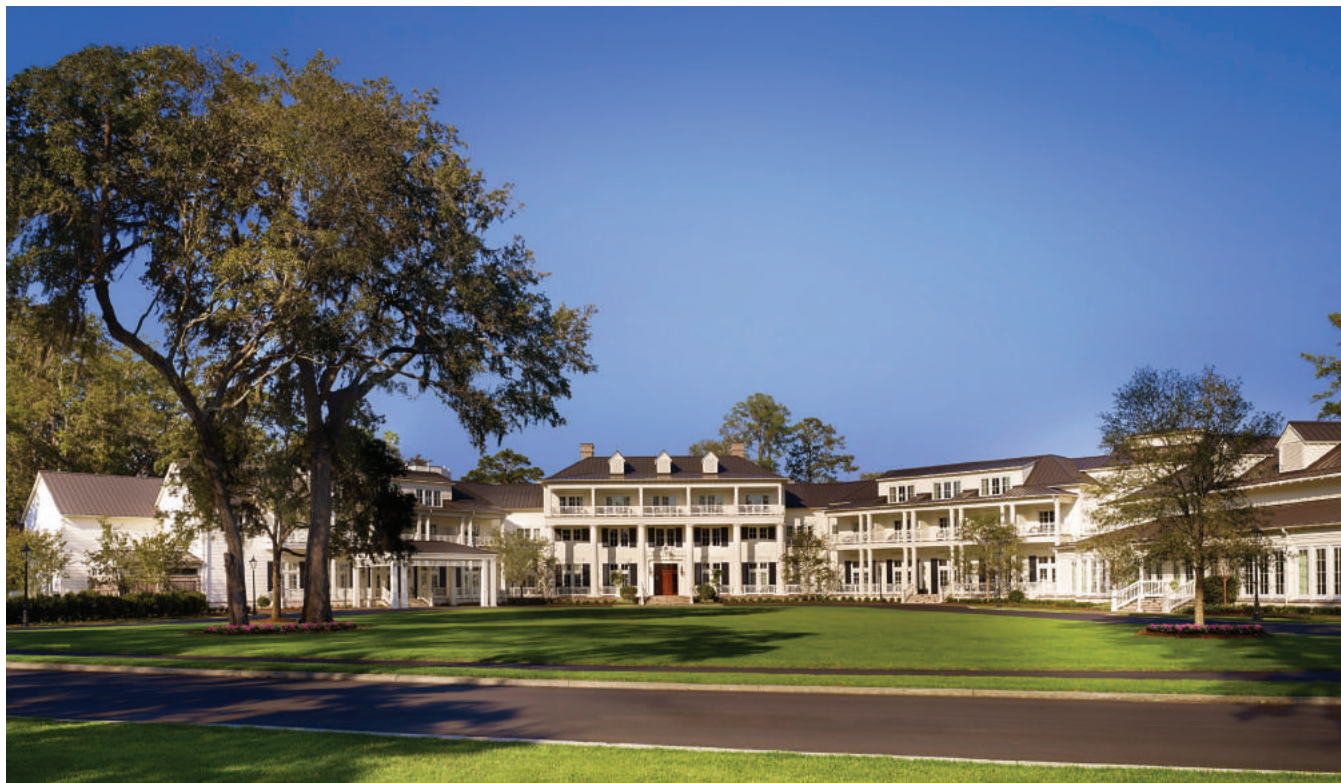
Montage Palmetto Bluff

Entering Palmetto Bluff is like entering a movie. From the minute you turn onto the access road to this otherworld of resort and residences, you know you've signed-up for a unique experience. For some, it may last a few nights. For others, it may be a lifetime. And, while this exercise in perfection may at first take you off guard, you will regain your breath in short order, because this is a place designed to help you breathe long and easy.