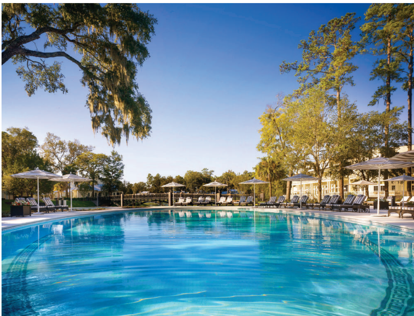
Pool at Montage Palmetto Bluff

have luxurious residential touches, such as vaulted ceilings, fireplaces, opulent bathrooms, and verandas with stunning views of waterways, flora, and fauna (watching the dozens of species of birds come and go at dusk and dawn is spectacular).