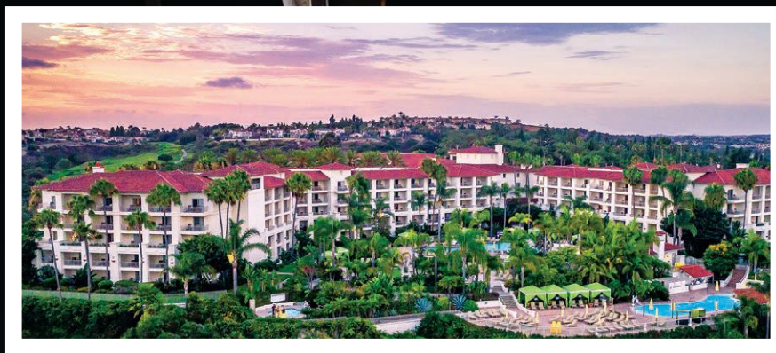
Inset: Park Hyatt Aviara Resort, Golf Club & Spa; background: Carlsbad is an ideal place for a weekend trip in northern San Diego County.

K nown by locals as “The Village by the Sea,” Carlsbad is a unique coastal destination in north San Diego County. Located just 40 minutes north of downtown, Carlsbad is close enough to experience all that San Diego has to offer while avoiding the noise and congestion of the city. With award-winning golf courses, local breweries,