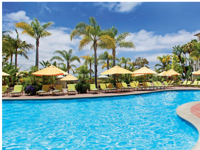
Left: the 18-hole championship course designed by legendary golfer Arnold Palmer, at Park Hyatt Aviara Resort, Golf Club & Spa; right: the resort's family pool—one of two options for cooling off on the property