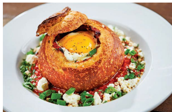
Toast Gastrobrunch offers classic dishes with a twist.

And, for those who aren't into sports, visit The Flower Fields, which are an incredible sight to behold—and only 10 minutes north of the resort. An endless expanse of vibrant ranunculus flowers carefully planted into distinct color-coordinated rows, it seems that no flower is out of place. Peak blooming season is typically mid-March to mid-April, but can vary depending on the season's