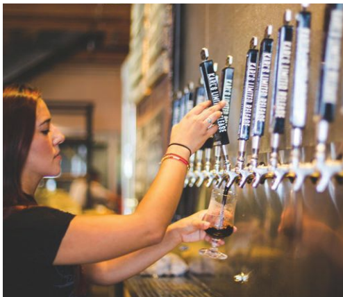
Many breweries serving a wide variety of beer can be visited in the Carlsbad area.

If you have kids, Legoland California Resort is the ultimate fun-filled activity for the whole family and just 15 minutes away. The park includes awe-inspiring miniature replicas of cities made entirely of legos (such as the Las Vegas Strip), more than 50 rides and interactive attractions—up from 12 rides when the park opened in 1999—plus live shows and a water park. As Legoland celebrates its 20th anniversary this year, 2019 is set to be filled with exciting perks passed down to attendees. Kids turning 12 this year (and younger kids) get free admission on their birthdays through the end of December, and the park recently debuted its