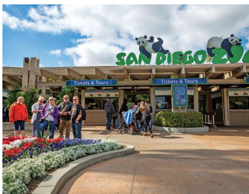
Clockwise from top: Legoland California Resort's 20th anniversary; San Diego Zoo; SeaWorld San Diego

along to the family-friendly pool, complete with water playground and underwater lighting. Grab lunch or light bites at the resort's poolside Ocean Pool Bar & Grill and indulge in some refreshing cocktails before you prepare for the evening.