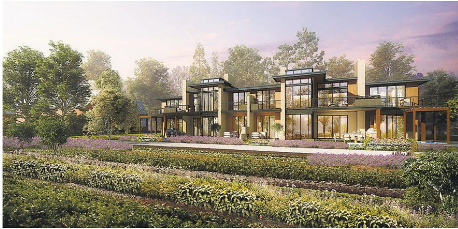
Pendry Residences Natirar

Roughly 30 minutes from Newark Liberty International Airport, Natirar is about 90 minutes from Philadelphia and about an hour from New York City. The resort includes the acclaimed 90 Acres restaurant, along with a cooking school set within a restored carriage house. There’s also a 12-acre farm and the restored