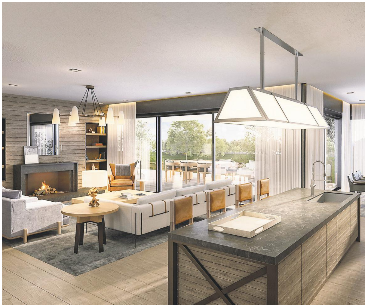
Pendry Residences Natirar

Features: Situated on hundreds of wooded and pastoral acres, the Pendry Residences Natirar is an upscale resort where construction on 24 luxury residences has begun. Farm Villa residences will be delivered fully furnished and feature two bedrooms, roughly 2,400 square feet of living space and private access to the resort's farm. Meanwhile, Estate Villa residences provide buyers a semi-custom home-building experience for domiciles ranging in size from 3,600 to more than 4,000 square feet. The resort includes a restaurant, a sprawling Tudor mansion and a cooking school.