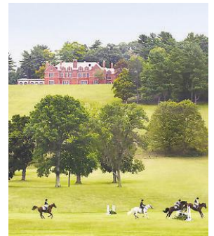
Pendry Residences Natirar