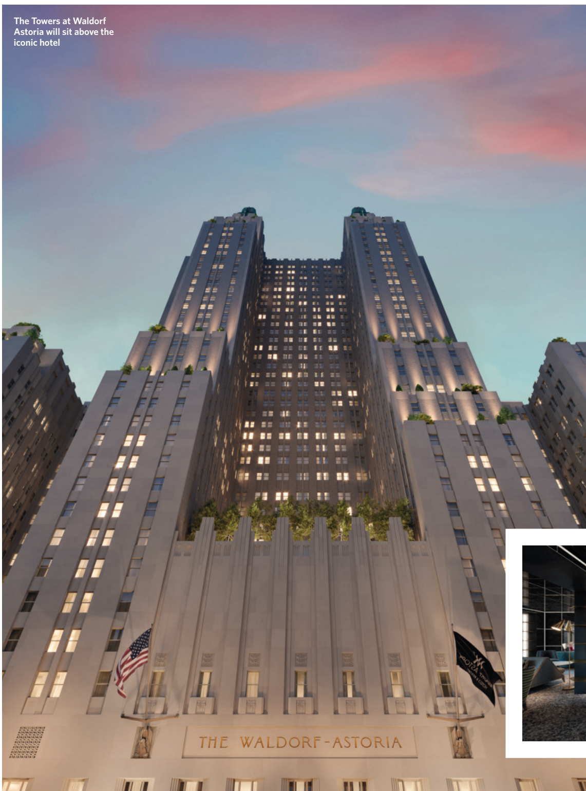
The Towers at Waldorf Astoria will sit above the iconic hotel