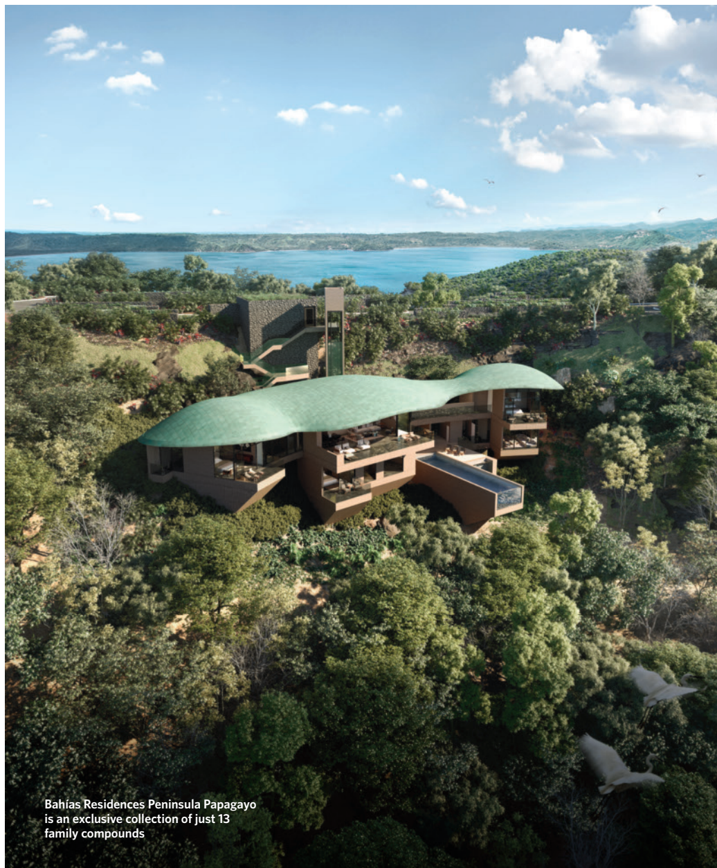
Bahías Residences Peninsula Papagayo is an exclusive collection of just 13 family compounds