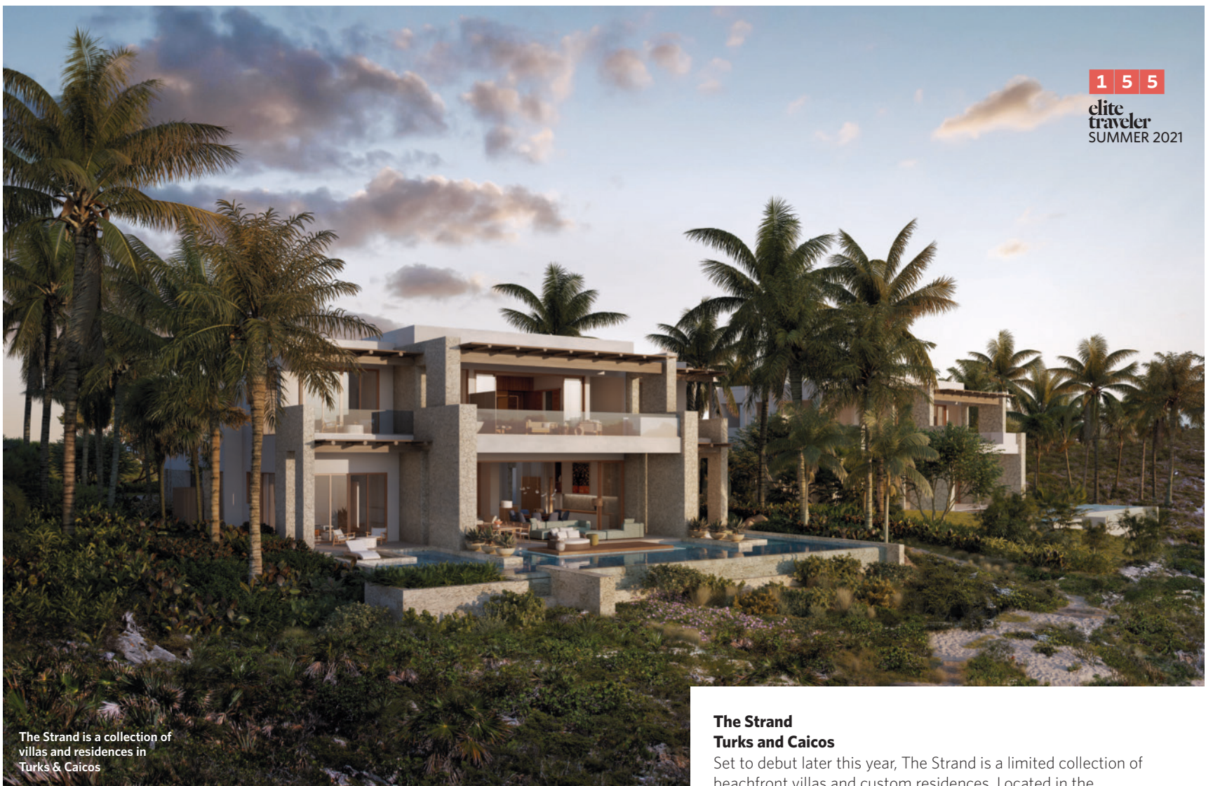
The Strand is a collection of villas and residences in Turks & Caicos