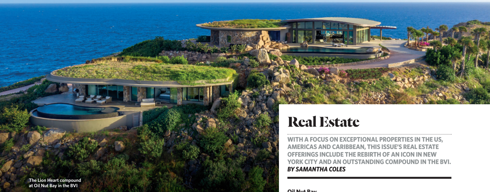
The Lion Heart compound at Oil Nut Bay in the BVI