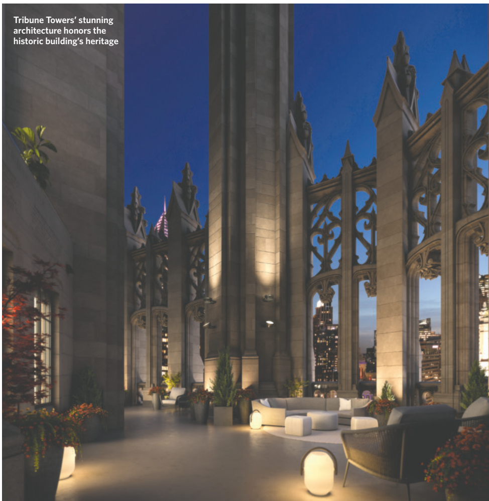
Tribune Towers' stunning architecture honors the historic building's heritage