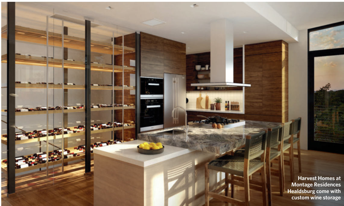
Harvest Homes at Montage Residences Healdsburg come with custom wine storage