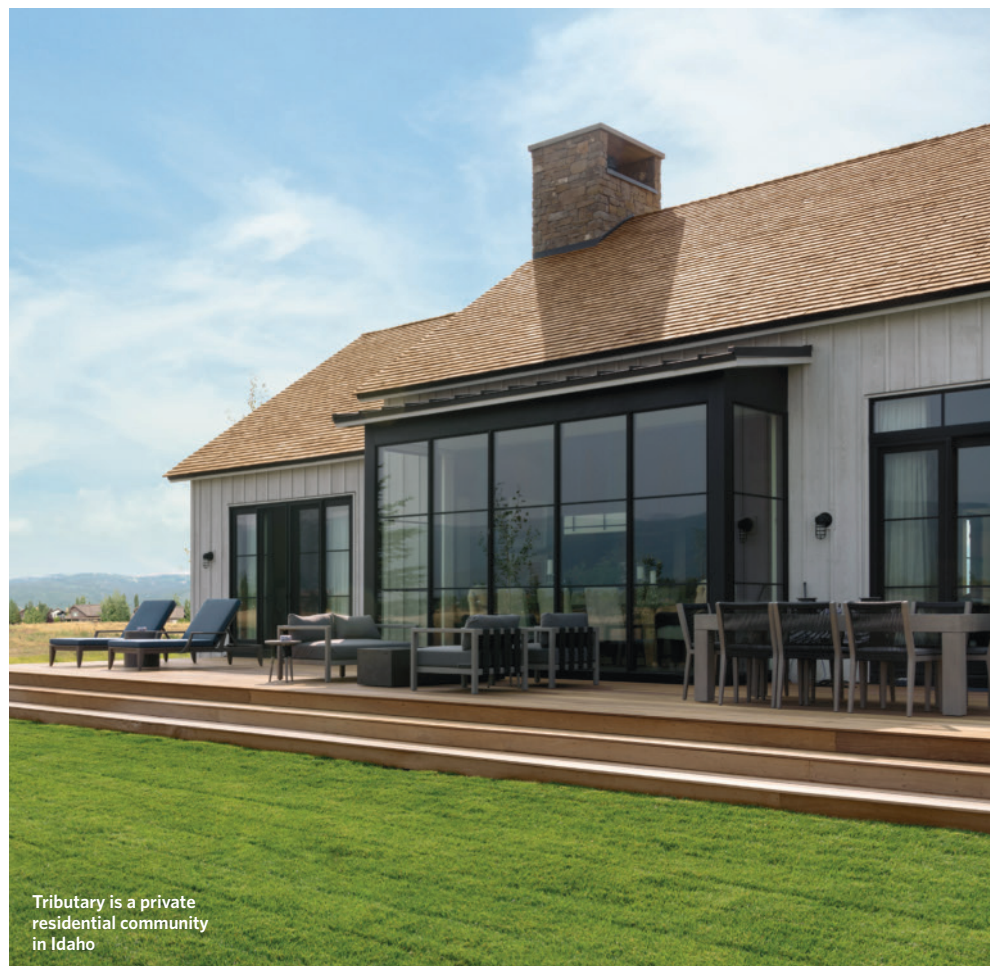
Tributary is a private residential community in Idaho