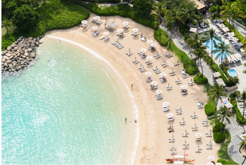
An aerial view of the Four Seasons Ko Olina Lagoon, O'ahu.

The Four Seasons in O'ahu will similarly display Malin's artwork within its luxury cabanas at its adults-only infinity pool with the signature cocktail on the menu. And a curated collection of Malin's fine art photography will be installed in the resort's newly remodeled penthouse suite, featuring the Ko Olina series.