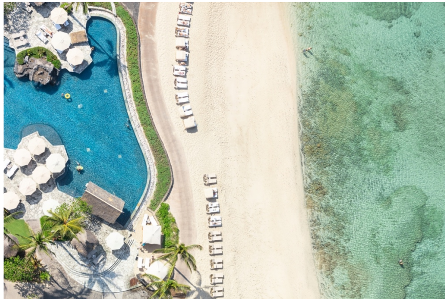
The Sea Shell pool at the Four Seasons Hualālai.

photography, creating memorable moments, and bringing people together. My collection with Four Seasons Resorts Hawaii mirrors that mindset by showcasing the renowned, picturesque island landscapes and capturing the spirit of aloha for people across the globe.”