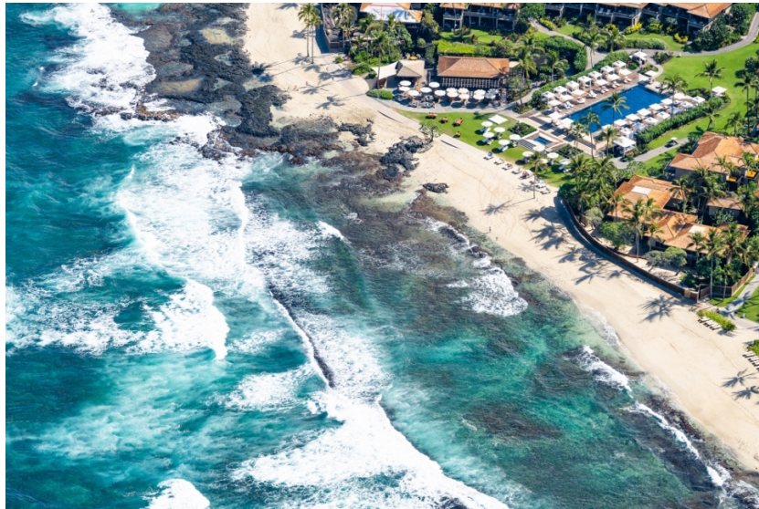
An aerial view of the Four Seasons Hualālai.

Malin is returning to one of his favorite locations, Hawaii, with a new series produced in collaboration with the Four Seasons hotel group.