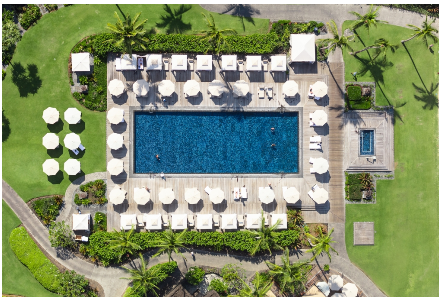
The Beach Tree pool at the Four Seasons Hualālai.

And while at first glance those photos might look like they were shot by drone—but they're most certainly not. Malin is both a fine art and aerial photographer, and for this series, he went old school by hanging out from a doorless helicopter to shoot his signature perspective.