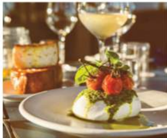
The Mozza Caprese salad at Mozza Baja.

These newer hotels join luxe Cabo favorites including serene Las Ventanas al Paraíso (which celebrates its 25th anniversary in July and has added a speakeasy piano bar, La Botica), Auberge Resorts' Esperanza, One & Only Palmilla (where Jennifer Aniston , Ashton Kutcher and Eva Longoria have vacationed) and the Waldorf Astoria Los Cabos Pedregal.