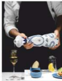
A tequila and culinary pairing at Clase Azul's tasting room.