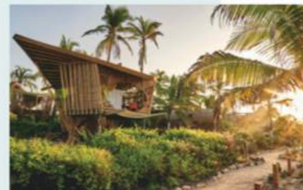
An oceanfront bamboo tree house (from $630 a night) at Playa Viva in Zihuatanejo.

Located on the pristine Riviera Nayarit, this breezy 59-room boutique resort (soft opening in April) features three scalloped pools, four culinary concepts and an 11-room spa, where local Huichol heritage and healing inspire the treatments; from $900, aubergeresorts.com/susurros — KATHRYN ROMEYN