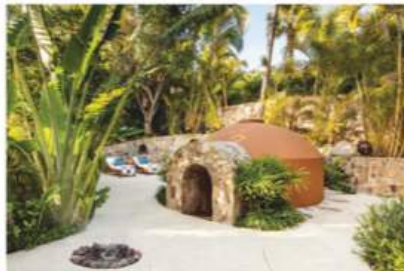
A traditional temazcal hut, similar to a sweat lodge, at One & Only Palmilla resort.