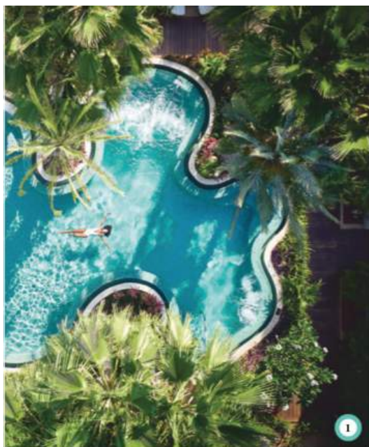
1 & 2 The spa pool at Zadún, a Ritz-Carlton Reserve, and the property's 2,900-square-foot, two-story Grand Reserve Villa, which includes up to five bedrooms, an outdoor shower and private plunge pools (from $10,282 a night). 3 An outdoor lounge at Four Seasons Resort Los Cabos at Costa Palmas 4 Dining spots at Nobu Hotel Los Cabos.