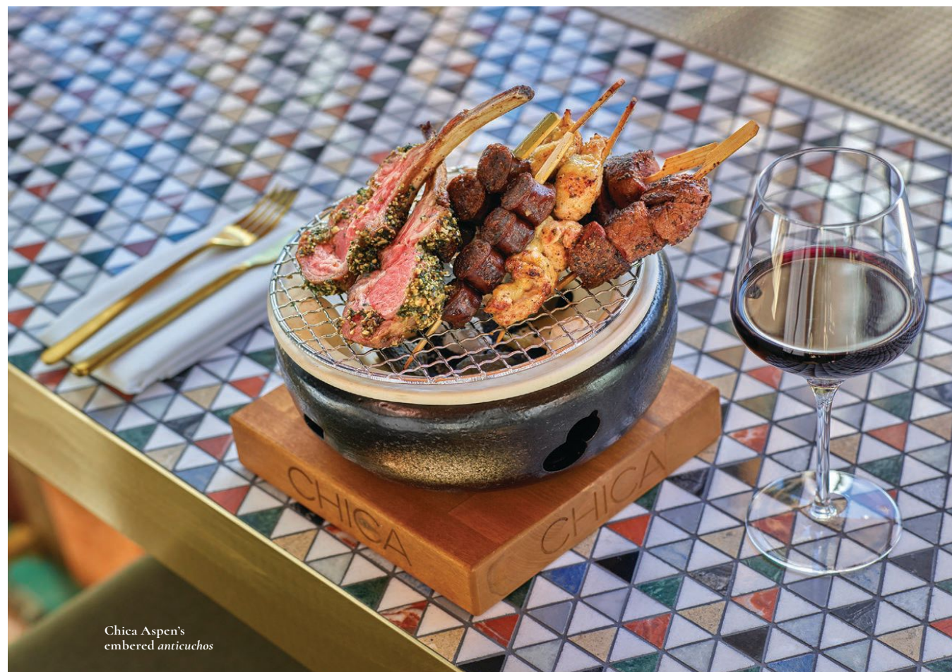
Chica Aspen's embered anticuchos

This slopeside restaurant's signature flatbreads and pizzas are topped with