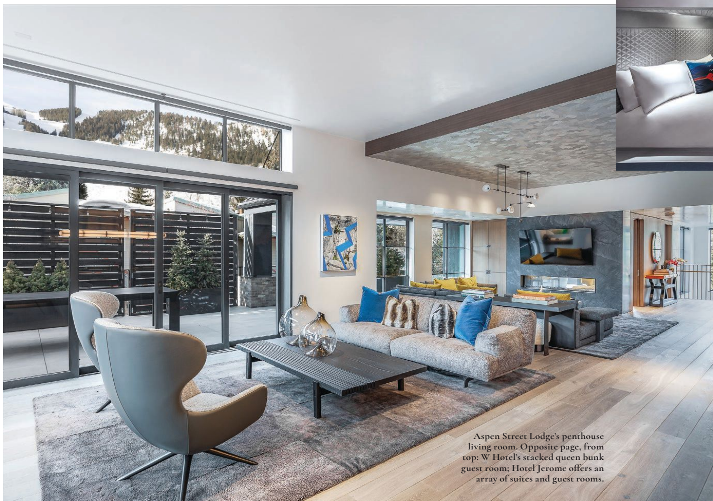
Aspen Street Lodge's penthouse living room. Opposite page, from top: W Hotel's stacked queen bunk guest room; Hotel Jerome offers an array of suites and guest rooms.