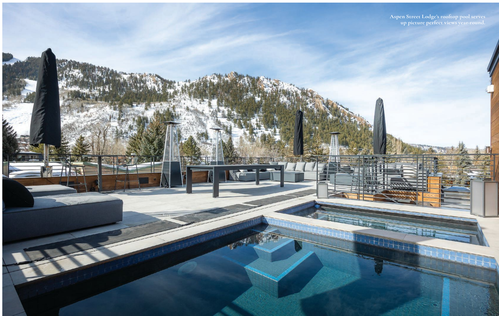
Aspen Street Lodge's rooftop pool serves up picture perfect views year-round.

the Snow Queen Victorian. Built in 1886 during the height of Aspen's silver boom, this family-run bed-and-breakfast charms guests with radiant-heat floors, private baths and complimentary breakfast. It's a quiet retreat from a hectic day in town. Three apartments at the Cooper Street Lofts are also available. 124 E. Cooper Ave., 409.200.5805, aspensnowmass.com