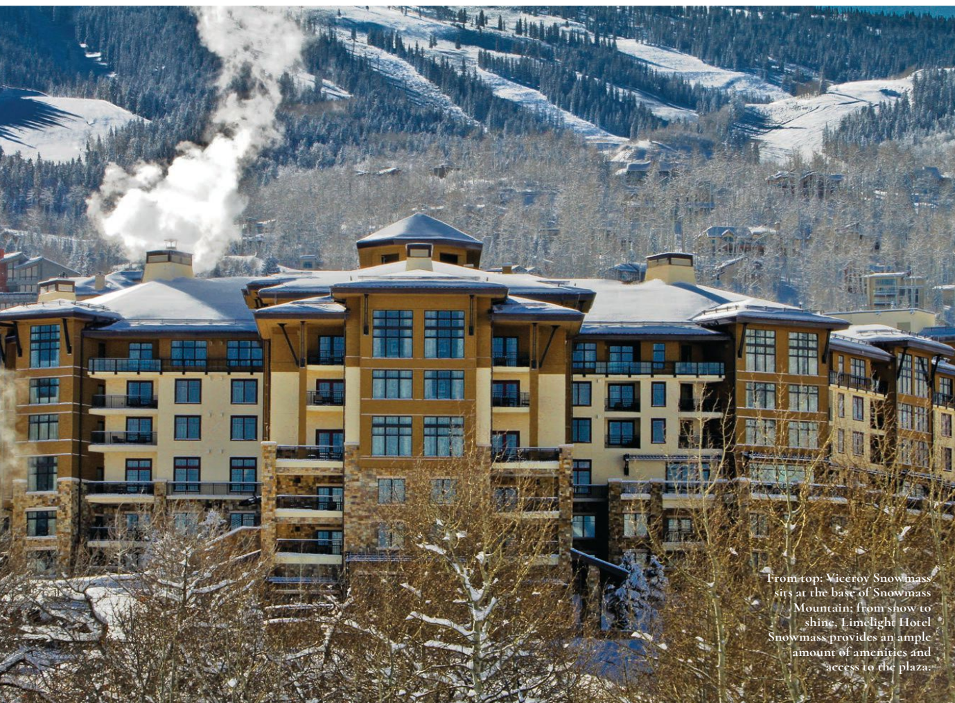
From top: Viceroy Snowmass sits at the base of Snowmass Mountain; from show to shine, Limelight Hotel Snowmass provides an ample amount of amenities and access to the plaza.

luxury vehicle rentals, horseback riding and mountain biking in the summer, it's the best of both worlds for everyone. For those wanting to just take in the view, the Viceroy also has a few indoor tricks up its sleeve. From the 7,000-square-foot spa with a wide range of holistic treatments to private yoga instruction to a mouthwatering lineup of culinary experiences (Nest Bar & Grill and Toro Kitchen & Lounge are absolute musts), the Viceroy is nothing less than a winter—and summer—wonderland.