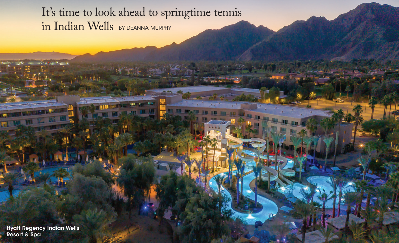
Hyatt Regency Indian Wells Resort & Spa

UNDOUBTEDLY THE TENNIS capital of the West Coast, Indian Wells has drawn tennisphiles from not just Southern California but around the world to the Coachella Valley for decades to witness top-tier professional tennis from the sport's biggest names like Connors and Sampras, Navratilova and Graf to Federer and Nadal, Williams, Sharapova, and Osaka.