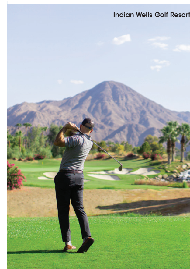
Indian Wells Golf Resort

INDIAN WELLS TENNIS GARDEN: PHOTO COURTESY OF BNP PARIBAS OPEN ALL OTHER PHOTOGRAPHY: COURTESY