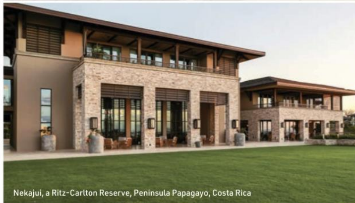
Nekajui, a Ritz-Carlton Reserve, Peninsula Papagayo, Costa Rica