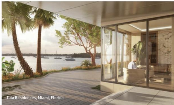
Tula Residences, Miami, Florida

Briland Club has partnered with The Royal Portfolio to manage its next phase of development on Harbour Island. This bay-to-beach community features 60 homes—Coral Cottages, Villas, and Estate Homes—starting at $4 million. The Royal Portfolio brings its hospitality expertise to this 27-acre enclave, which includes curated experiences, beach club amenities, and the only megayacht marina on the island. Homes are designed with a nod to Loyalist-era charm while embracing sustainable practices like advanced water systems and clean power. brilandclub.com