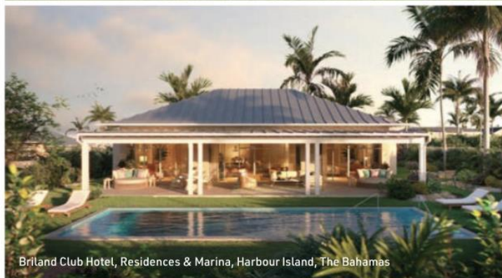
Briland Club Hotel, Residences & Marina, Harbour Island, The Bahamas