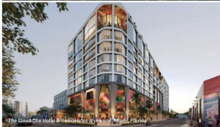
The Cloud One Hotel & Residences Wynwood, Miami, Florida